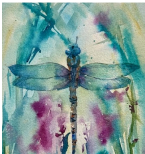
Painting Watery Watercolors with Janice Castiglione