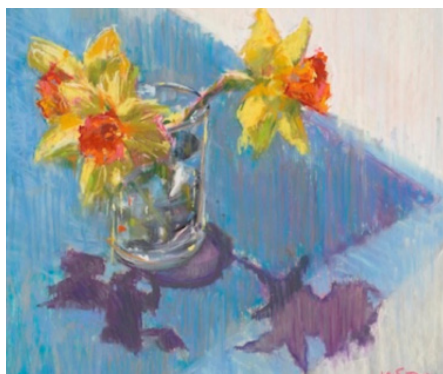
Mini Paintings with Maximum Results with Jeri Greenberg