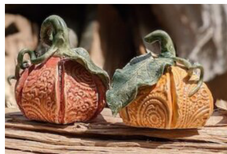
Handmade Pumpkins with Shannon Gehen