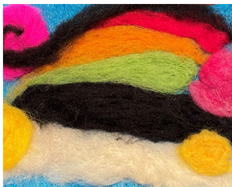
Needle Felting with Suzanne Sload