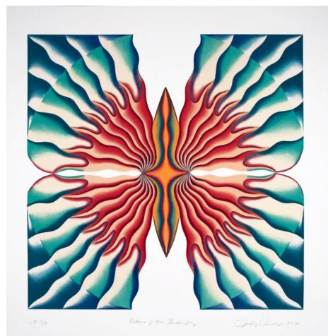
Judy Chicago. Return of the Butterfly, 2012