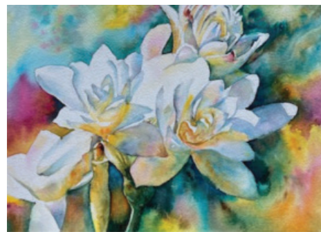
Fruits and Florals with Janice Castiglione