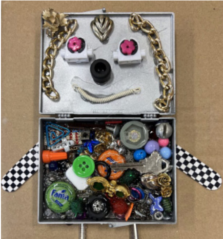
Living Art Loud with Brooks Koff