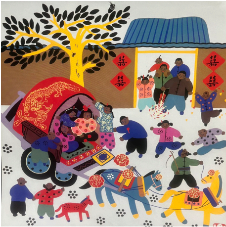
Folk Painting with Judith Chandler