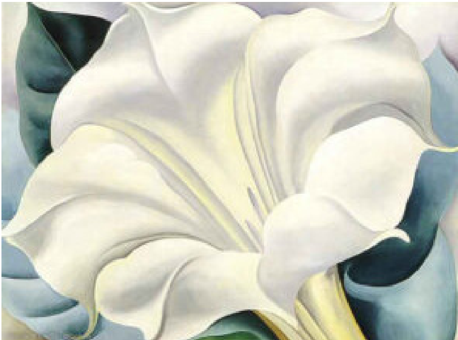
Georgia O'Keeffe, The White Flower (White Trumpet Flower), 1932, Oil on canvas, 30 x 40 inches, Can Diego Museum of Art