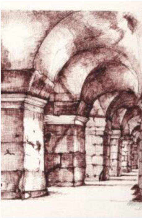
Expressive Architecture with Antoinette Vogt