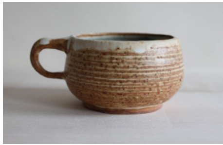
Intro to the Pottery Wheel with Matthew French