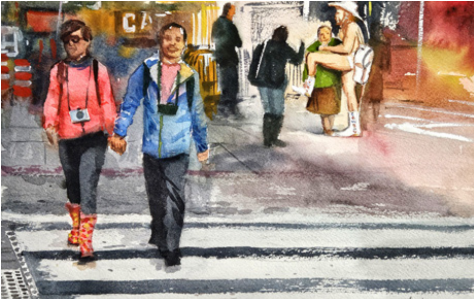
Painting People in Watercolor with Todd Carignan