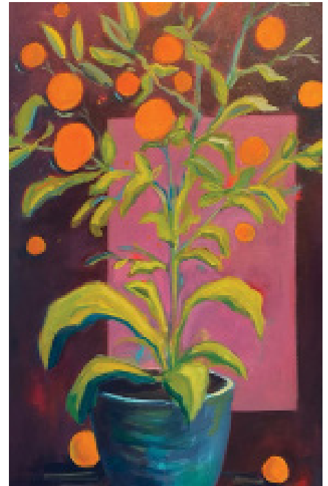
Color 101 with Kirah Van Sickle