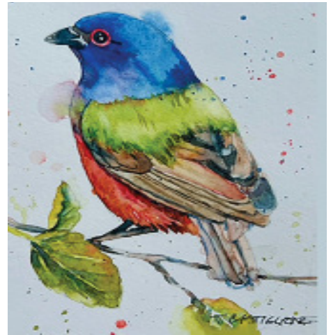
Birds in Watercolor with Janice Castiglione