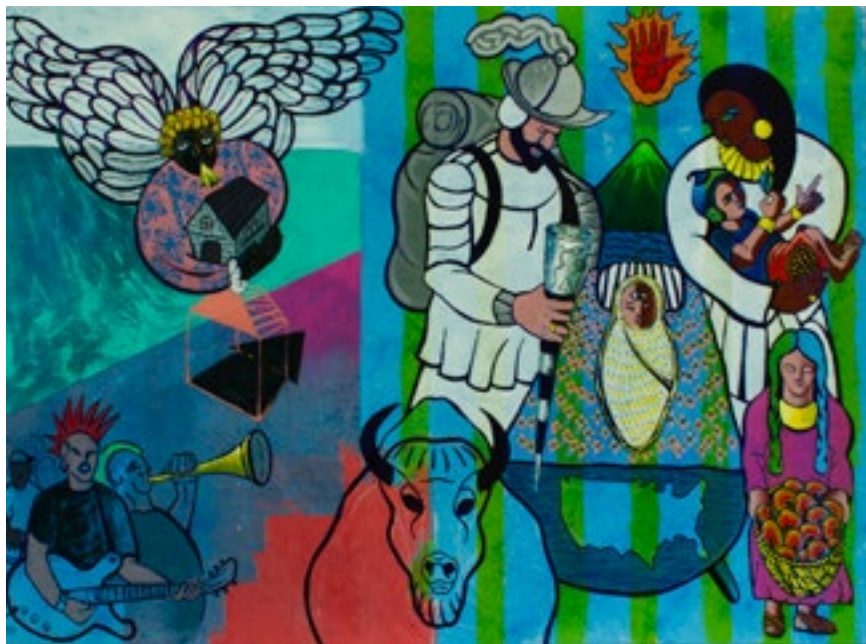
Renzo Ortega (Peruvian-American, b. 1974) Mestizaje , 2019 Acrylic on unstretched canvas 9" h x 12" w