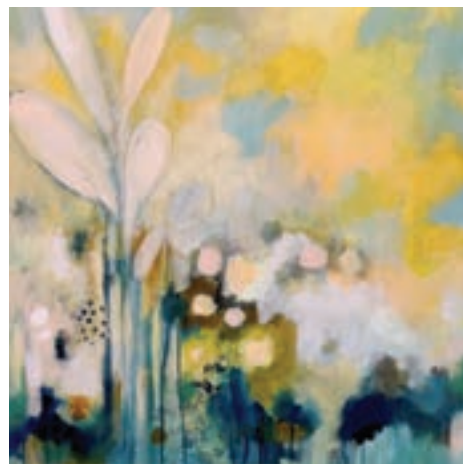
Color and Composition: Fundamentals of Acrylic Painting with Kirah Van Sickle