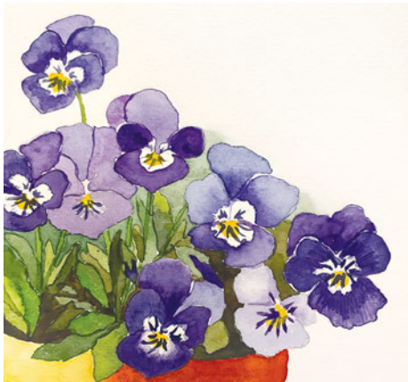
Image: Drawing Inspired by Nature: Fall Foliage with Antoinette Vogt